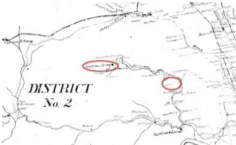
1898-1902, Map of Travis County Roads shows original Oak Grove School on what is now Old Lampasas Trail (was then Bull Creek Rd) and the Venable homestead.