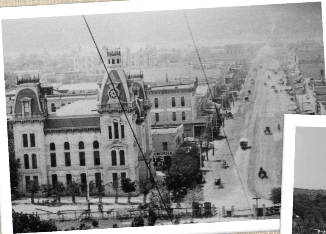
1876 Travis County Courthouse, looking down Congress Avenue -Photo No. PICA 01093, Austin History Center, Austin Public Library