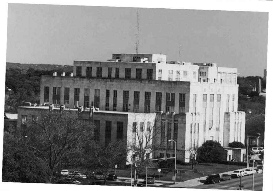
Heman Marion Sweatt Travis County Courthouse, present day